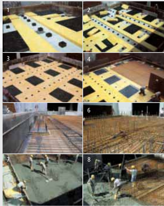
Illustration 1, 2, 3: Depositing of BILZ insulation plates (green) and padding of the spaces with mineral fibre insulation plates (sacrifice formwork). Illustration 4: Covering of the entire area first with PVC sheeting as used for construction work, and then with mineral fibre cover plates. All joints must be pasted/glued together. Illustration 5, 6: Mounting of reinforcement. Illustration 7, 8: Filling in of concrete.

As a result of years of experience we have the necessary experience in this field. At your request we can offer all other related services including measuring of vibrations, planning and construction design.